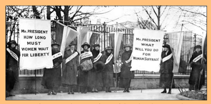
Women suffragists picketing in front of the White house. (February 1917)