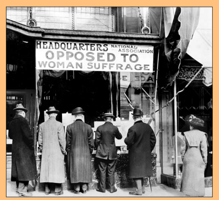
Men looking in the window of the National Anti-Suffrage Association headquarters. (CA, 1911)