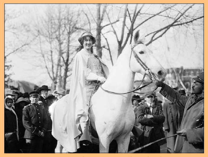
Inez Boissevain, wearing white cape, seated on white horse at a suffrage parade in Washington, D. C. (March 13, 1913).