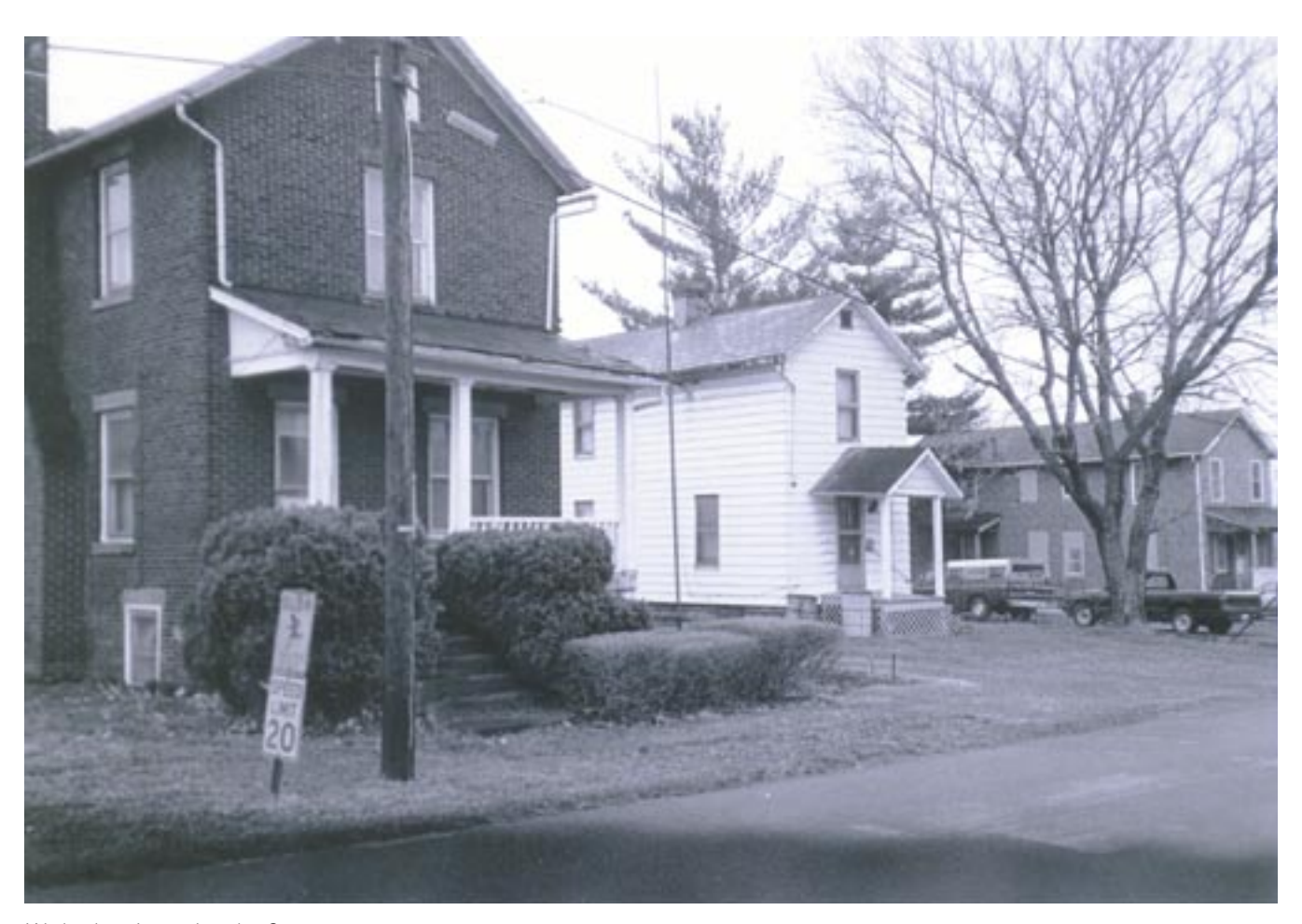
Worker housing on Langley Street.

pay period (see the example in Figure 1). Students were asked to write down ten items they found significant or unusual about the payrolls. These apparently simple instructions in fact prompted students to use critical thinking skills to compare and contrast the payrolls, and to make connections between these primary documents and their knowledge of local history during this period.