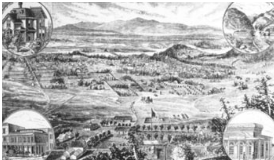
Boise is located in a valley next to a range of hills, the Boise Front. This view of Boise, drawn from the hills, shows the city, the Boise River, and the Owyhee Mountains beyond.

Idaho State Historical Society. Photograph by Virgil M. Young