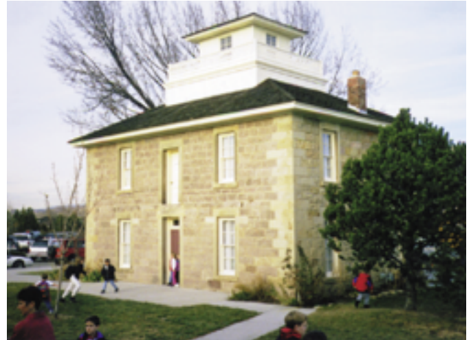
The Bown House, Boise, Idaho, now a living social studies museum.

After the Bowns died, the house passed to other owners and gradually deteriorated. When the Boise School District bought the property for a new school, the old dwelling was judged unfit for habitation and slated to be torn down until the Idaho Historic Preservation Council became interested in saving the Bown House.