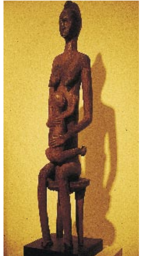
West African sculpture

(The naming is followed by prayers and celebration for the rest of the day.)